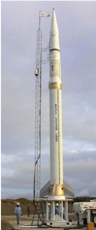
ait-2 on Launch Stool Kodiak Island, Alaska

Space Vector's two-stage Medium Range Target Vehicle (MRTV) is the ideal choice for ground launched medium range target missions. Originally developed and flown by Space Vector for the United States Air Force, the MRTV is capable of ranges in excess of 2,100 km with apogee above 1,000 km. The vehicle is horizontally integrated on a custom transporter erector and stool launched providing the user greater flexibility in launch site selection.