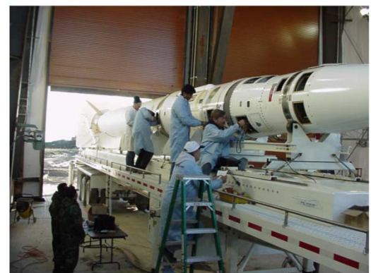
Space Vector Launch Team During Final Arming